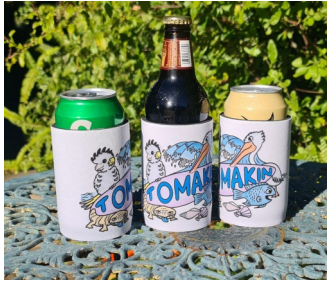
Stubby Holders $12