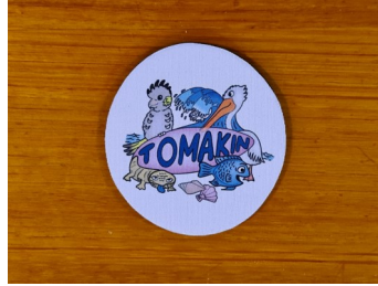
Coasters $15 set of 4