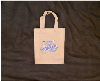
Tote Bags $15

A range of awesome Tomakin themed merchandise designed by one of our talented committee members, is now available for purchase!