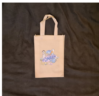
Tote Bags $15

A range of awesome Tomakin themed merchandise designed by one of our talented committee members, is now available for purchase!