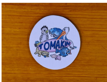
Coasters $15 set of 4