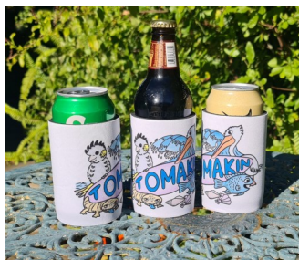
Stubbie Holders $12